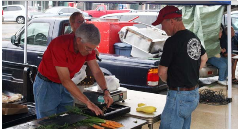
July 19, 2008 – Governor Daniels stopped to buy some home-grown Hoosier produce at a Farmer's Market in Rochester.