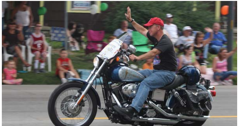
July 19, 2008 – Governor Daniels joined the Indiana Patriot Guard on his motorcycle at the Peru Circus Parade.

Want to listen to the governor's most recent media availability? Click here to listen!