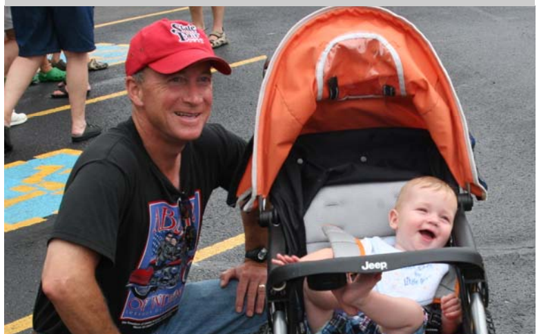
July 19, 2008 – Governor Daniels shared a laugh with a young Hoosier at the 25th Annual Culver Lake Fest.