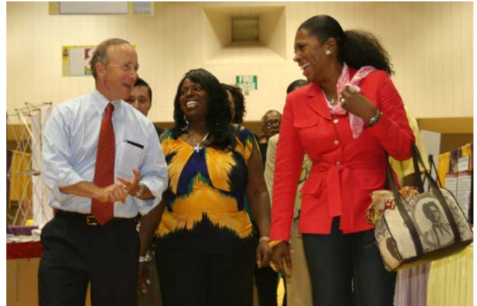
July 17, 2008 – Governor Daniels gave brief remarks and took a tour of the INShape Indiana Black and Minority Health Fair at the Indiana Black Expo Summer Celebration. More than $1,000 of free medical screenings were available to individuals.

Reminder: Hoosiers living in the 40 counties approved for FEMA individual assistance must apply by August 11. Visit www.emergency.in.gov for more information.