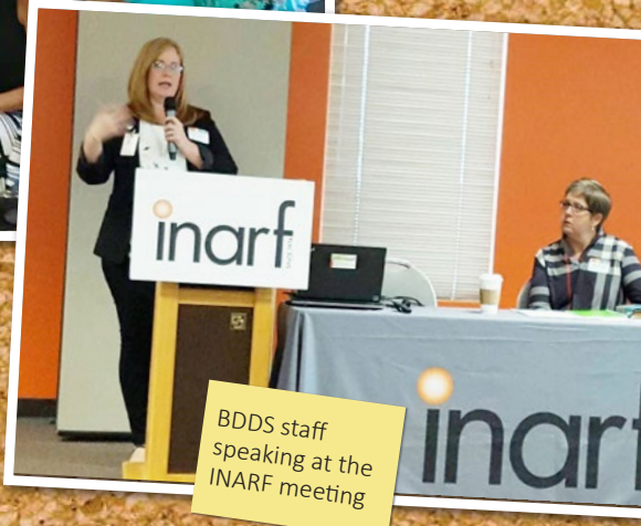
BDDS staff speaking at the INARF meeting