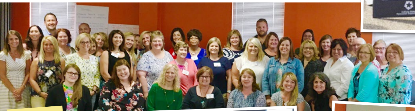
Big First Steps meeting was well attended.