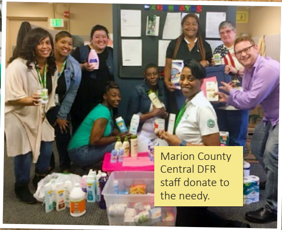
Marion County Central DFR staff donate to the needy.