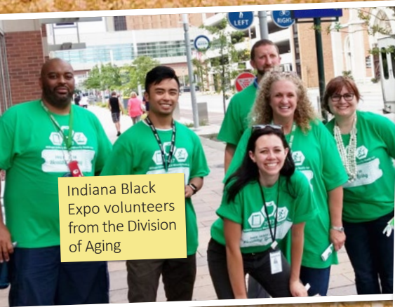
Indiana Black Expo volunteers from the Division of Aging