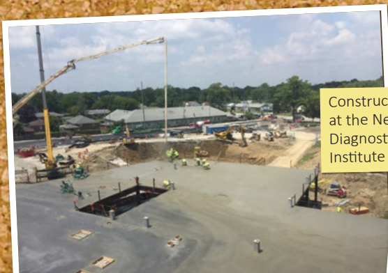
Construction at the Neuro Diagnostic Institute site