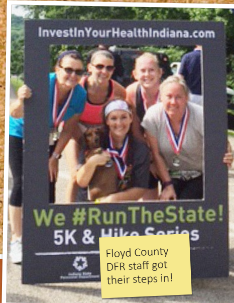
Floyd County DFR staff got their steps in!