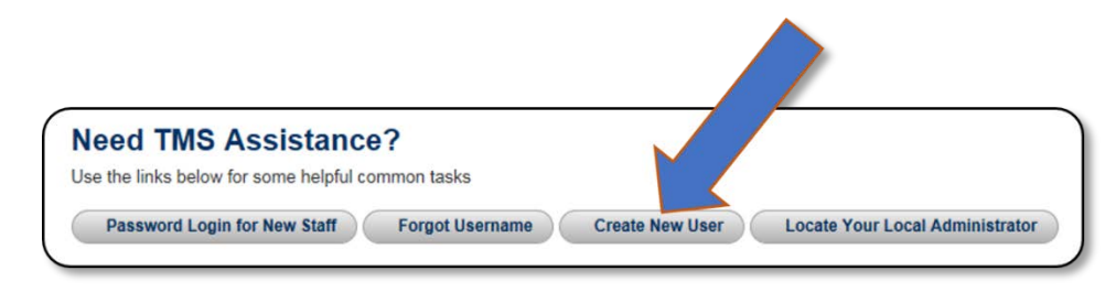
Figure 1: VA TMS Login Screen with Arrow pointing to the Create New User Button

3. The first screen requires you to select the overall VA organization that you will be supporting.