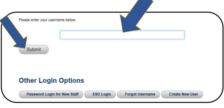
Figure 10: TMS 2.0 Login Screen

After 20 minutes have passed, please return to <u>https://www.tms.va.gov/SecureAuth35/</u> and enter your Username and click Submit. You will be able to send a one-time Passcode to your Email Address.