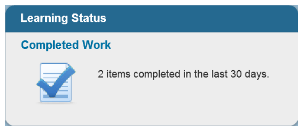
Figure 17: Example of the Learning Status Pod

6. Once all of the mandatory training has been completed, you will see the Learning Status Pod display information stating that the work is completed.