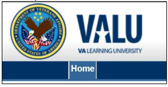
Figure 16: Snapshot of the Home Link

5. Once a course has been completed, select the HOME link located at the top left of the screen to return to your TMS Home screen.