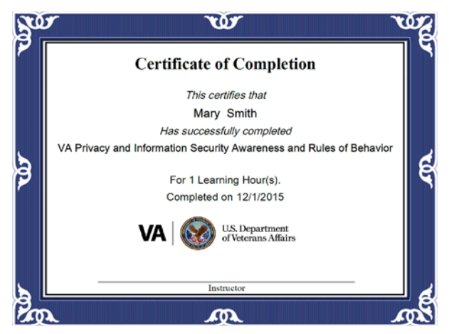
Figure 21: Example of Certificate of Completion PDF

Once the necessary information has been gathered, another browser window opens and displays a PDF of the Completion Certificate.