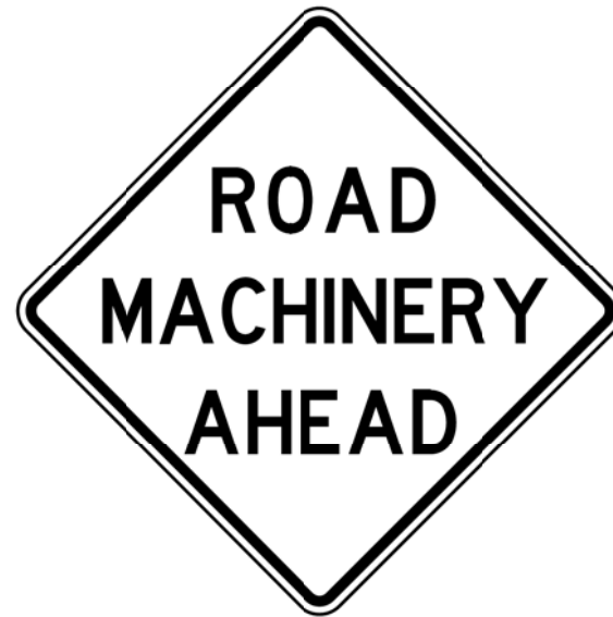
XW21-3-A (10) (9)