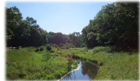
Dunes Creek Daylighting

The LMCP supports conservation by providing technical and financial assistance to communities and nonprofit organizations seeking to acquire land and effectively restore and manage natural resources.