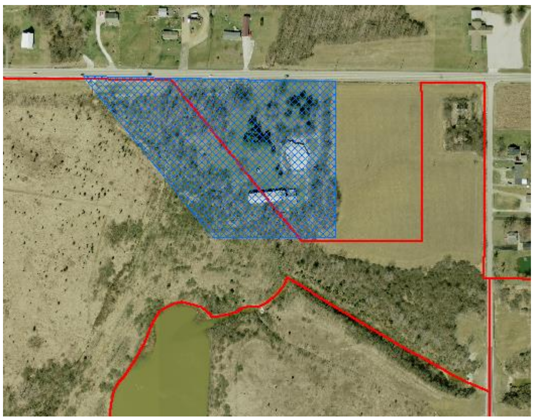
This shows the proposed new configuration of the Snellenberger property in the blue cross hatch. IDNR property lines would then be shifted to match the revised Snellenberger configuration.