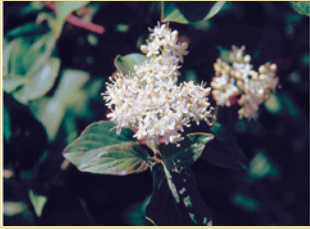
Dogwoods ( Cornus sericea , C. amomum , and C. racemosa )