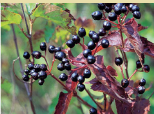
Northern arrowwood ( Viburnum dentatum )