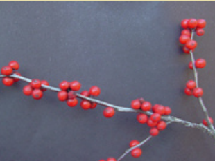
Winterberry ( Ilex verticillata )