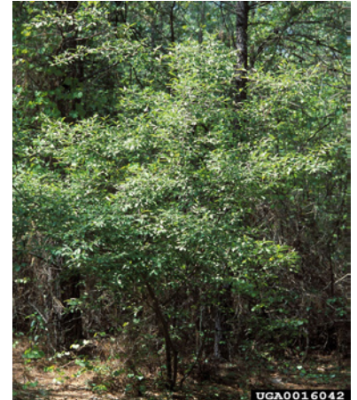
An autumn olive plant.

bark on the lower portion of the woody plant is also an effective control. Multiple treatments may be required. Always read and follow pesticide label directions.