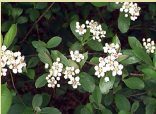
Chokeberry ( Aronia melanocarpa )