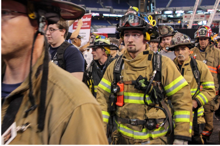
Before the 9/11 Memorial Stair Climb, firefighters lined up and walked though a crowd of supporters.