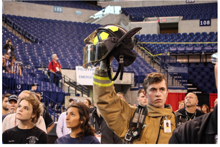
During the 9/11 Memorial Stair Climb opening ceremony, firefighters raised their helmets as a salute.