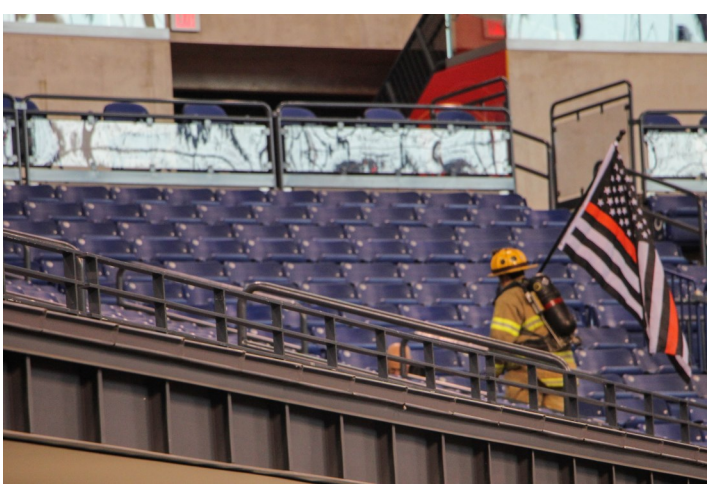
A firefighter carried an American flag during the memorial climb.