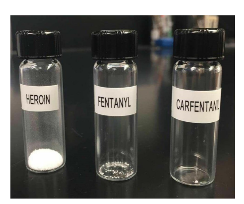
A visual of the dose of heroin, fentanyl and carfentanil needed to kill an average adult.

administering high doses of naloxone can reverse an overdose of carfentanil or fentanyl. In the case of more potent opioids, many more doses of naloxone may be required to reverse an overdose. Responders should be prepared with additional doses of naloxone.