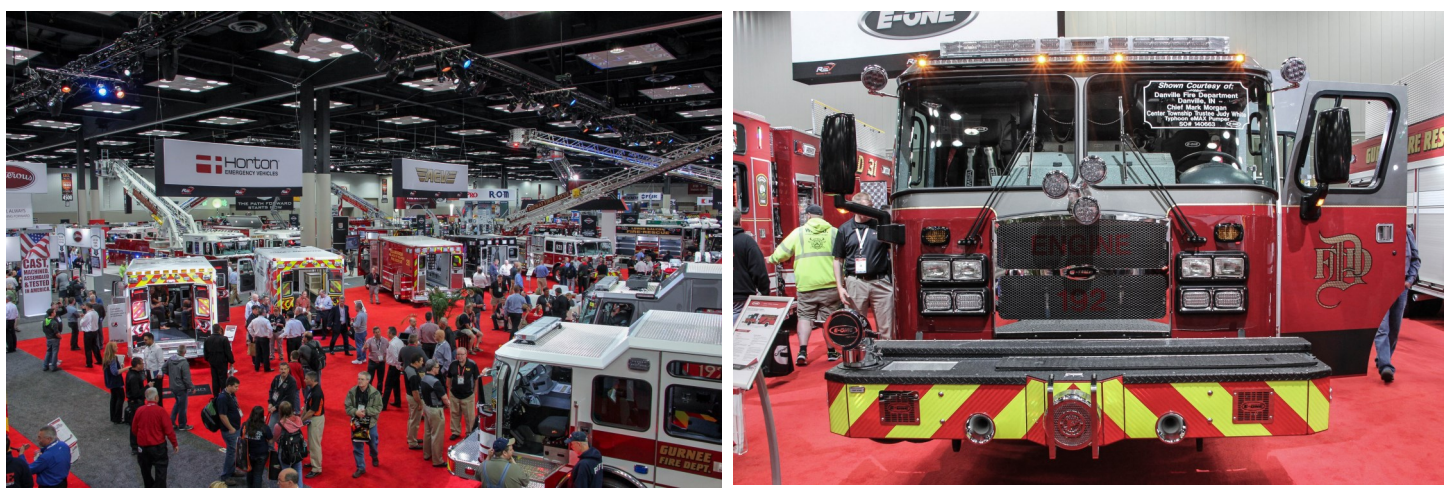
Along with the 33,979 attendees, there were 798 exhibitors at FDIC this year.