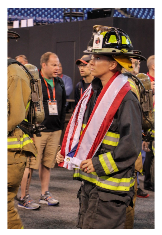
Firefighters climbed the equivalent to 110 stories at Lucas Oil Stadium in memory of the 343 firefighters who made the ultimate sacrifice on September 11, 2001

The 2018 FDIC is set to occur April 23-28, 2018 with even more attendees and exhibitors. For more information on FDIC, visit www.FDIC.com.