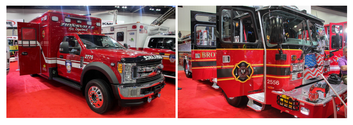
Four Indiana fire engines and ambulances were displayed at FDIC 2017. The vehicles were from Zionsville Fire Department (bottom left), Brownsburg Fire Territory (bottom right), Danville Fire Department (middle right) and Jennings County Board of Commissioners (featured on pages 1 and 6).