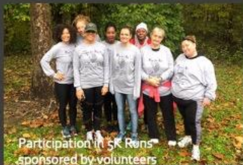
Participation in 5K Runs sponsored by volunteers