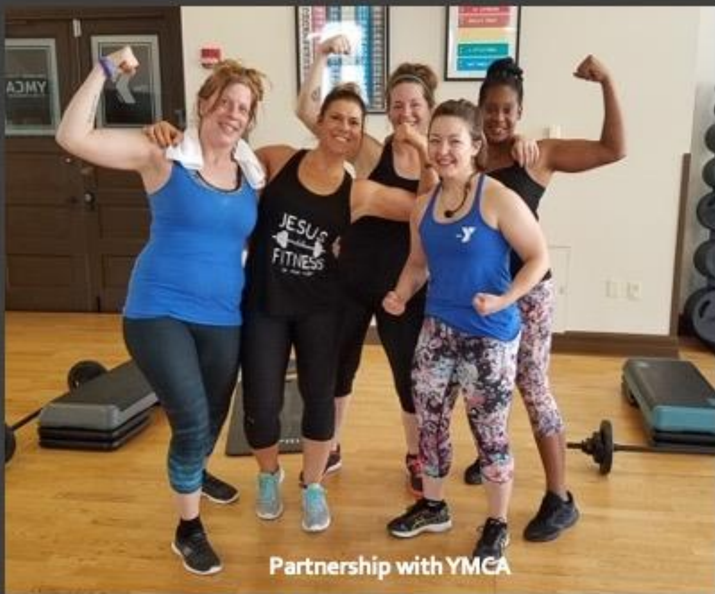
Partnership with YMCA