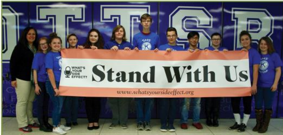
▲ Scottsburg High School Key Club Austin High School Dimensions Show Choir ▼