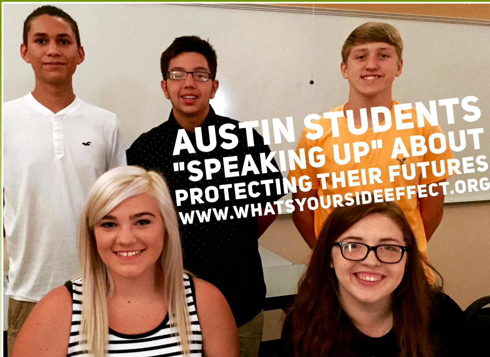
Austin High School students "speak up" and inform their peers about Rx drug abuse prevention as part of our "What's Your Side Effect?" positive social norms campaign.