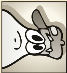
MOTOR OIL GUY

ALIBES: The Paper. PROFILE: Recycling is a black and white issue with the Newspaper Guy. He can be recycled into pencils, notebook paper, grocery bags and newspapers. His crimes include Office Paper Guy and Computer Paper Guy, who also are wanted for recycling.