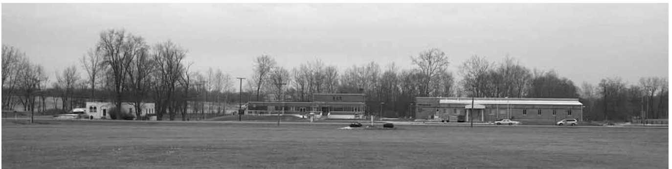
Three generations of drinking water treatment plants in Hillsboro, Ohio

Contractors will typically do whatever the owner requests, even when it is wrong.