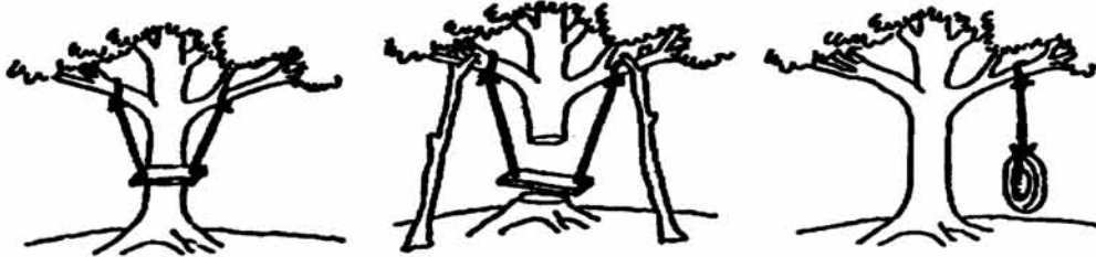
As shop fabricated it