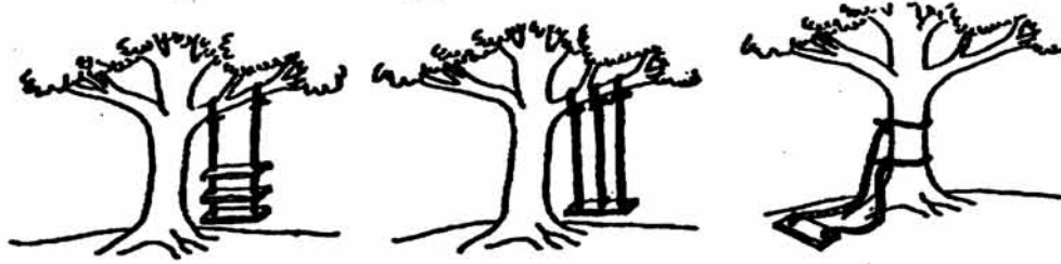
As architect drew it