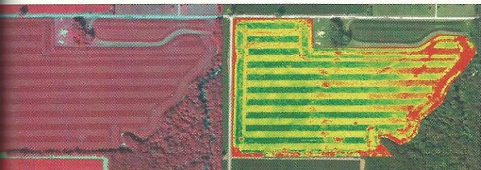
These paired images are from a field that was planted in 2013 with two hybrids in a split planter. The image on the right is the NDVI, while the left is the NIR image.

It is important to note that aerial imagery does not eliminate the need for scouting. Indiana OFN uses imagery to look for systematic issues that are impacting the field's ability to produce high yields. Many of the issues that we see are addressed with management or equipment modifications that can have lasting impact.