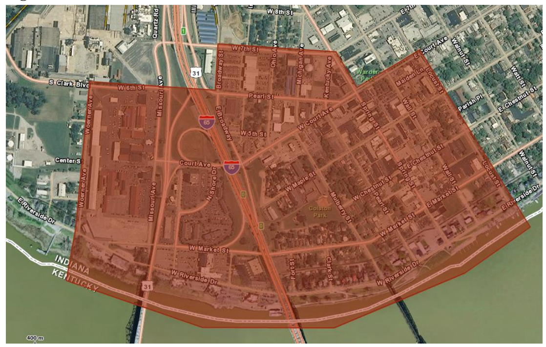
Figure 2: Downtown Jeffersonville

them were either retailers or restaurant operators. Their own estimates ranged from a 15% to 50% reduction in business as a result of the Project.