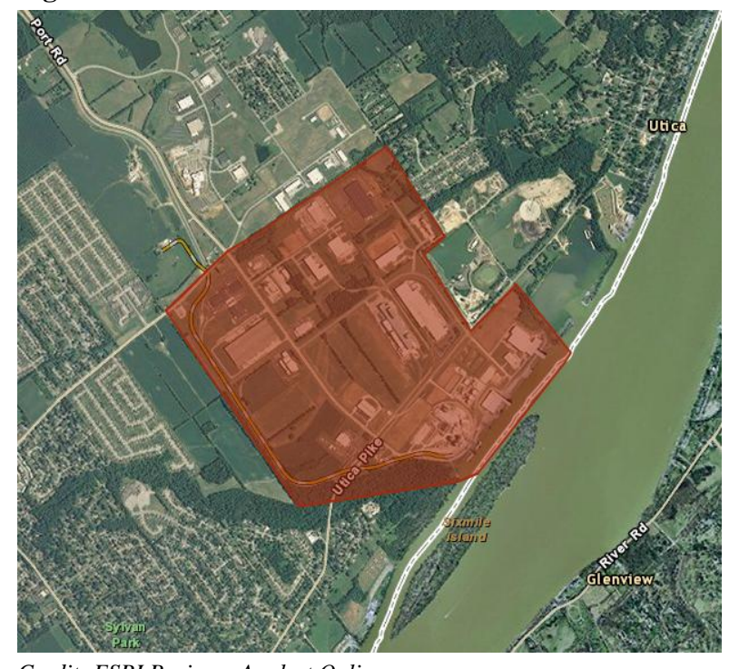
Figure 3: Port of Indiana-Jeffersonville

total of 1,350 people. 12 If developed at current densities, the remaining 300 vacant acres at the Port can support an additional 602 employees.