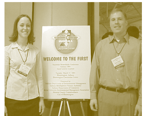
Student volunteers from Indiana University Environmental Management Association greet conference participants.

Following the opening remarks, a panel presentation provided a brief overview of general brownfields concepts and types of brownfields assistance available to stakeholders through state and federal programs, including the U.S. Environmental Protection Agency (EPA) and U.S. Housing and Urban Development (HUD). Successful projects often involve a public/private partnership, a partnership that is often a cooperative effort among local, state and federal governments.