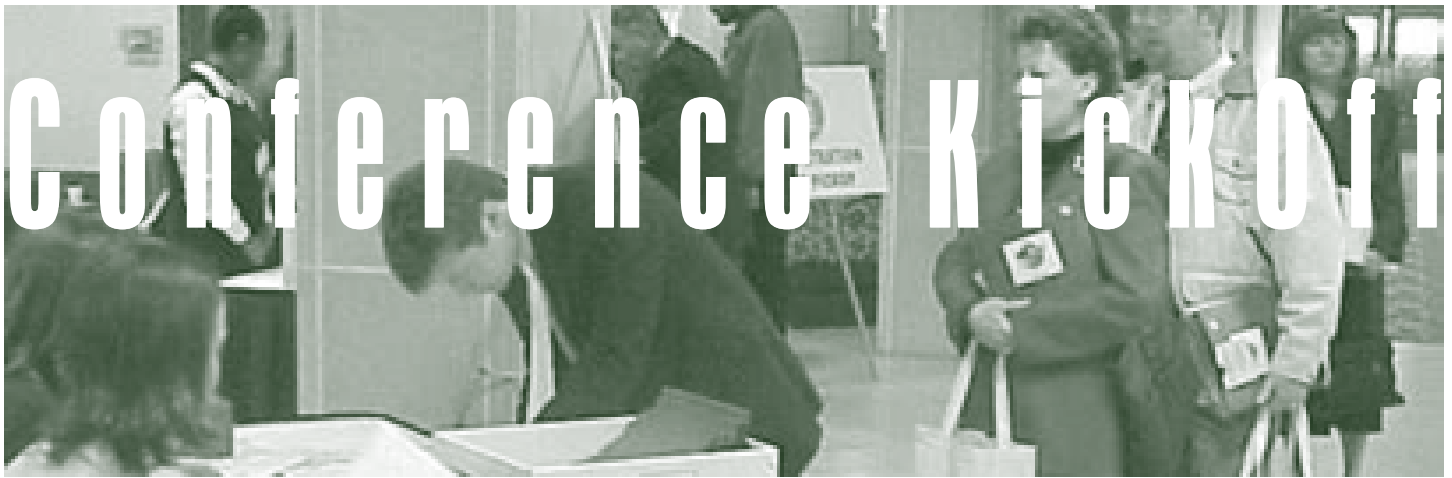
Conference attendees sign in at the On-Site Registration table.

The kickoff to the State wide Brownfields Conference was the session Brownfields Over Breakfast , where opening remarks were provided by a “who’s who” of dignitaries in the Indiana brownfields arena. The first speaker was State Senator Vi Simpson of the 40 th Senate District, which includes the city of Bloomington and Monroe County. Senator Simpson, who is responsible for introducing Indiana’s first brownfields legislation, spoke of “recycling land” by using partnerships between levels of government and of the opportunities for economic development.