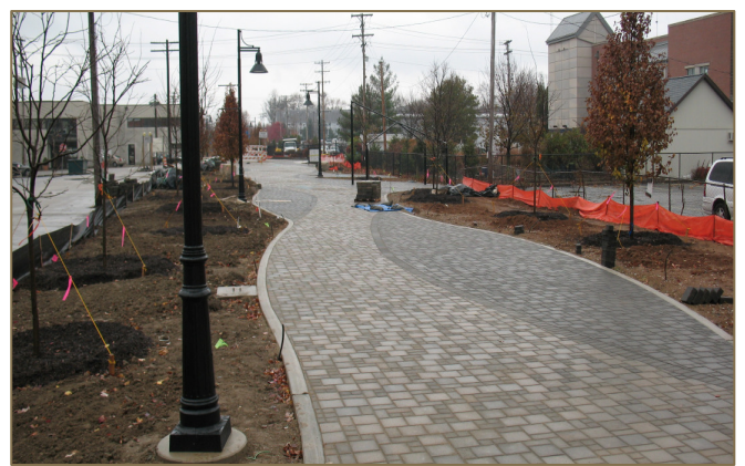
The B-Line Trail under construction

Grant was awarded by the Program in February 2009.