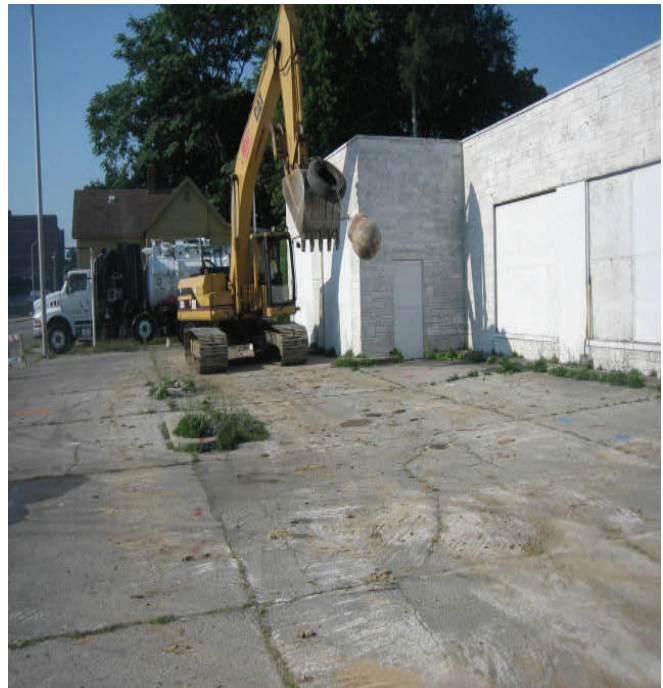
Former DX Service Station, Muncie -- Breaking concrete above underground storage tank basin

On-site petroleum-contaminated soil and groundwater were discovered during a June 2011 Phase II Environmental Site Assessment, and in August 2011, four USTs, 718.24 tons of contaminated soil, and 700 gallons of sludge and water were removed from the Former DX Service Station site. One hydraulic lift and an associated oil-holding tank were also removed from inside the building, using state petroleum grant funds. None of the soil samples collected from the UST and lift excavations exhibited soil contamination above IDEM’s Risk Integrated System of Closure (RISC) Industrial Default Closure Levels (IDCLs). Groundwater samples collected from the site monitoring wells indicated the achievement of applicable RISC closure levels, and the site is being closed with an institutional control.