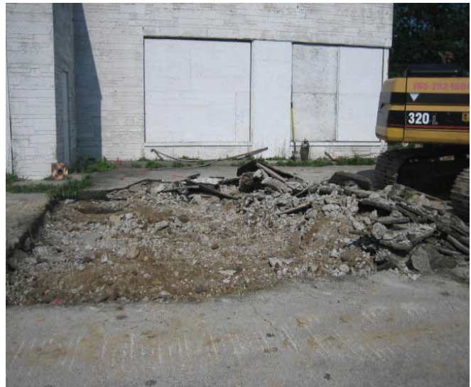
Former DX Service Station, Muncie -- Excavation of contaminated soils

The Former McKey’s Union 76 Station site located at 817 E. Willard Street historically operated as a retail gasoline station between 1937 and 1994 and was then inactive until the on-site building was razed in 2010. Currently, Delaware County owns the site, which is expected to be redeveloped for commercial use.