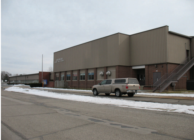
Before: Former Leesburg Elementary School, Leesburg