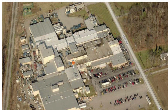
Former Meridian Automotive Facility, Grabbill