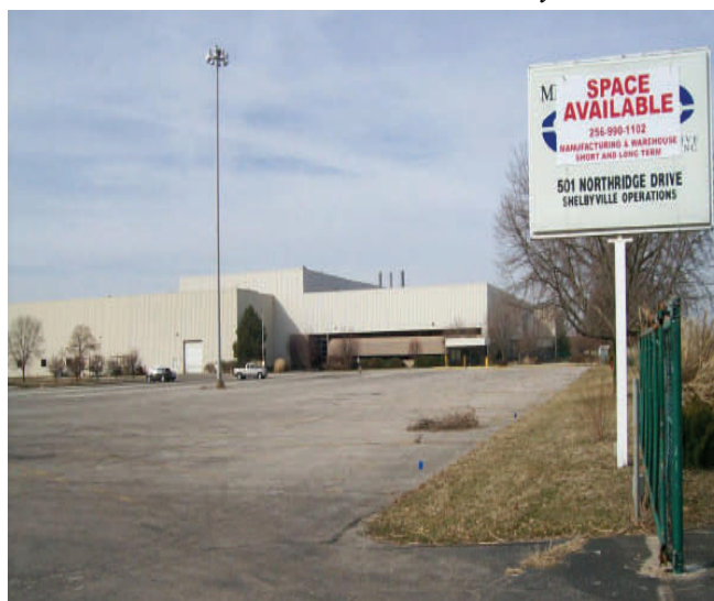
Former Meridian Automotive Facility, Shelbyville