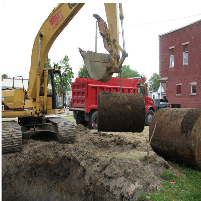
Former McKey's Union 76 Station, Muncie— Removal of underground storage tanks

Petroleum-contaminated soil was discovered during a February 2011 Phase II Environmental Site Assessment. In May 2011, a Ground Penetrating Radar (GPR) survey was performed to confirm the presence of subsurface structures prior to remediation activities. In June 2011, three 560-gallon USTs, 288.13 tons of petroleum-contaminated soils, and 499 gallons of liquid waste were removed and properly disposed from the site. Confirmatory soil samples revealed contamination remaining along a wall of the UST excavation abutting a residential property. In August 2011, an additional 185.47 tons of contaminated soil were excavated from the adjacent residential property to the west of the Former McKey's Union 76 Station site. Analytical results of the soil confirmation samples collected during excavation, and groundwater samples collected from site monitoring wells, showed that applicable RISC closure levels have been achieved.