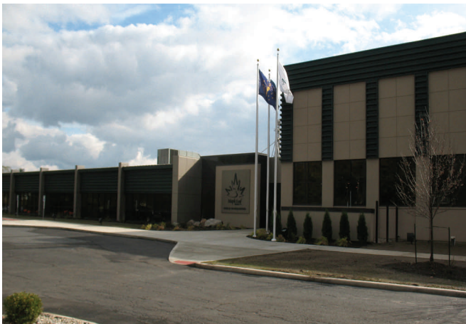
After: Maple Leaf Farms, Leesburg