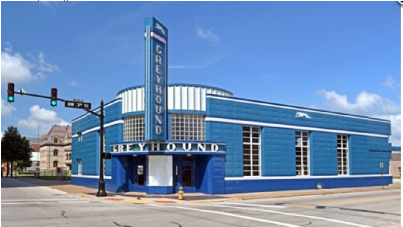
Photo of Greyhound bus terminal after restoration courtesy of Lee Lewellen.