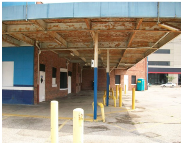
Former dispenser and refueling area