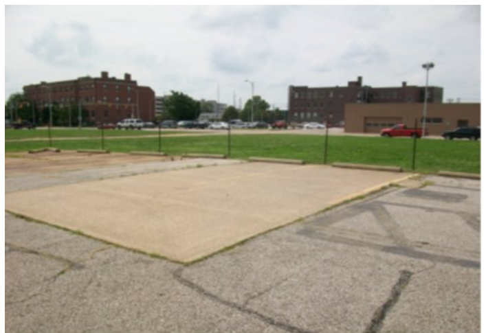
Former UST pit and excavation area