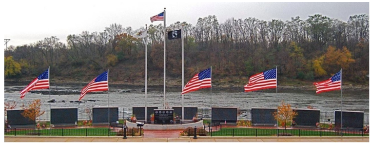
Ride with Rolling Thunder®, Inc. Indiana Chapter One on their third annual ride to Marseilles, IL to participate in the Illinois Motorcycle Freedom Run to Honor our Global War on Terror fallen Heroes and their families.