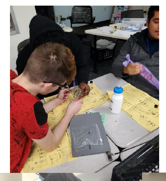
Left: Students work in small groups to identify macroinvertebrate samples by using dichotomous keys.