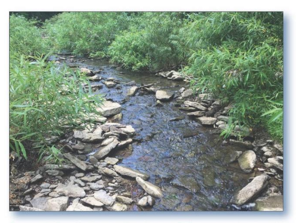
Figure 2. South Hogan Creek now fully supports aquatic life use.

IDEM conducted Performance Monitoring in 2015 on Little Hogan Creek, which showed great improvement. The macroinvertebrate IBI score was 44 and no longer failing. The fish IBI (which had not been failing) had also slightly improved. IDEM also conducted Performance Monitoring on South Hogan Creek in 2019, which showed a greatly improved fish IBI score of 50. The macroinvertebrate IBI (which had not been failing) had remained the same. In addition, the stream habitat was flourishing and showed small improvement from the previous visit, with a Qualitative Habitat Evaluation Index score of 77 (Figure 2). IDEM has determined that a score of less than 51 is indicative of