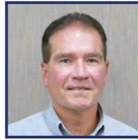
Bruce Burrow Rumpke of IN LLC, Southern District