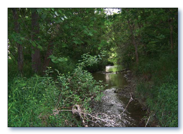
Figure 2. Jenkins Ditch in 2011.

Among the many partners involved in these activities were the Clinton, Howard, Tipton, and Tippecanoe County Soil and Water Conservation Districts (SWCDs); the Greater Wabash River Resource Conservation and Development Council; Purdue Cooperative Extension; Hoosier Riverwatch; and the U.S. Department of Agriculture's (USDA) Natural Resources Conservation Service (NRCS).