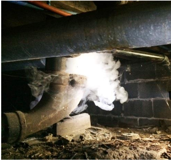
Figure 2. Visual observation of smoke at a potential sewer gas leak.