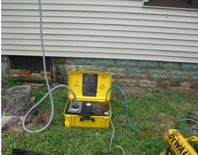
Figure 1. Compressor and smoke generator with attachment going to the roof vent.

A smoke test by a licensed plumber can identify locations where gases may be escaping sewer piping. An artificial smoke generator is attached to the roof vent (Figure 1). Smoke can be visually observed at leaks in the system (Figure 2).