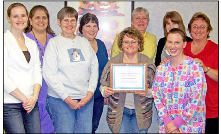
Parkview Whitley Family Birthing Center staff