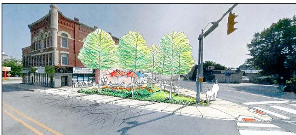
A proposed trail rest stop in Huntington, Indiana. By Pete Fritz, AICP, PLA.