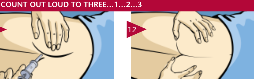
Slowly count to 3 while holding buttocks together to prevent leakage.