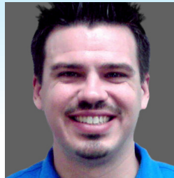
Contributor: Benjamin Ross INSAFE CONSTRUCTION SAFETY CONSULTANT