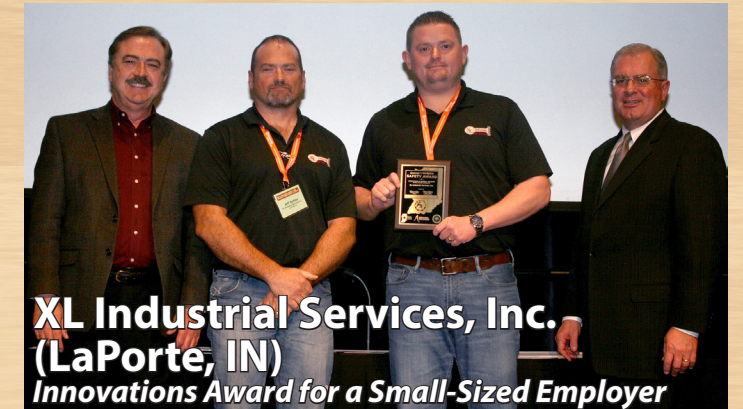
XL Industrial Services, Inc. (LaPorte, IN) Innovations Award for a Small-Sized Employer