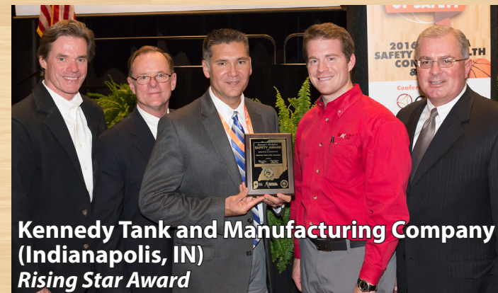
Kennedy Tank and Manufacturing Company (Indianapolis, IN) Rising Star Award