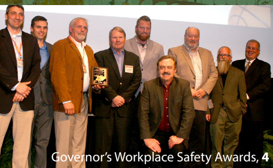
Governor's Workplace Safety Awards, 4