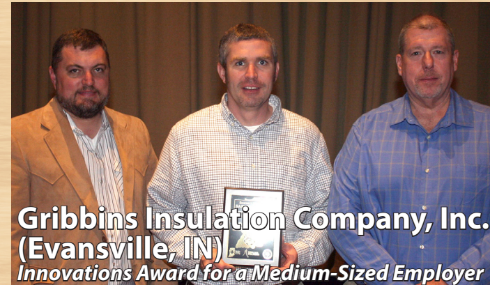
Gribbins Insulation Company, Inc. (Evansville, IN) Innovations Award for a Medium-Sized Employer