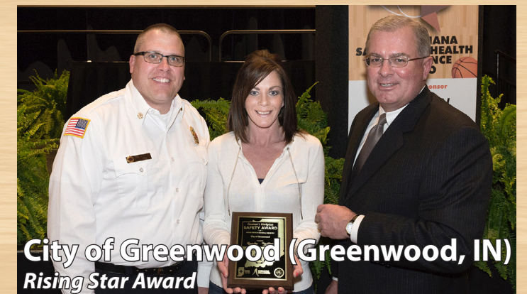
City of Greenwood (Greenwood, IN) Rising Star Award