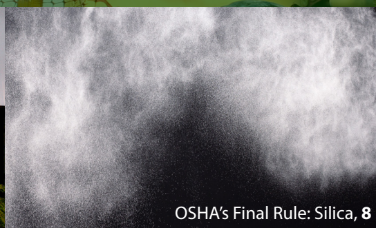
OSHA's Final Rule: Silica, 8