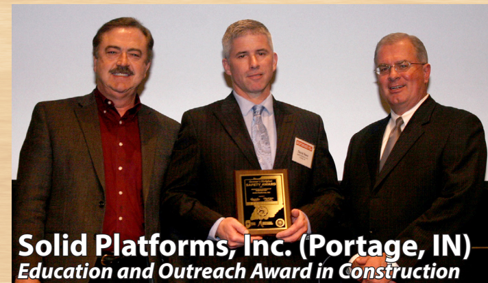
Solid Platforms, Inc. (Portage, IN) Education and Outreach Award in Construction