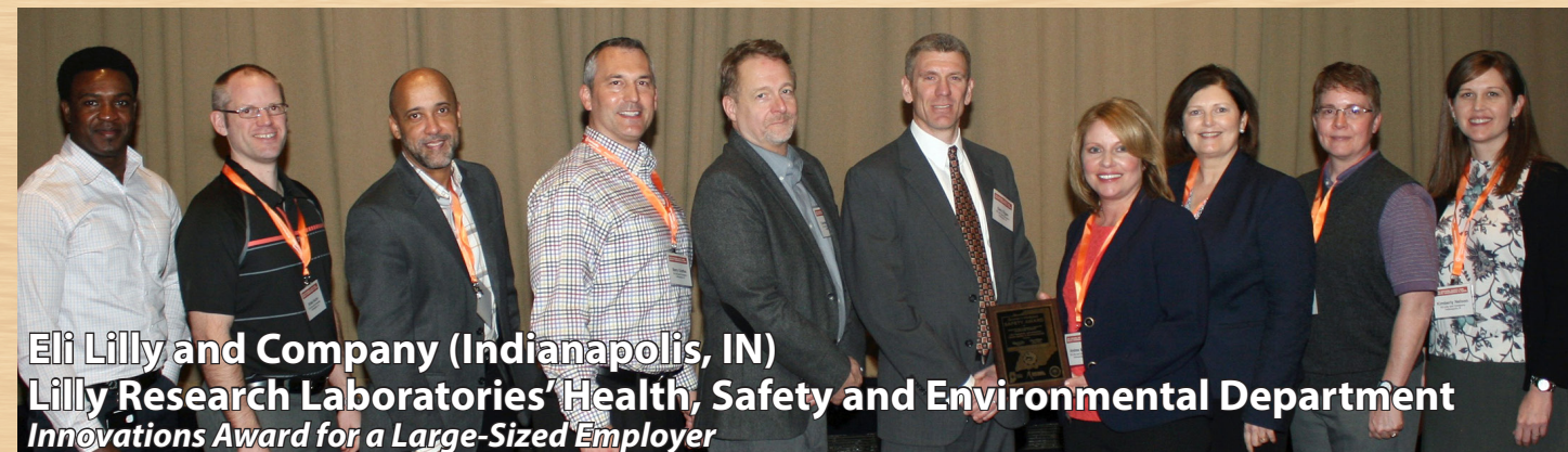
Eli Lilly and Company (Indianapolis, IN) Lilly Research Laboratories' Health, Safety and Environmental Department Innovations Award for a Large-Sized Employer

The Indianapolis Roofer's Safety Group consists of five roofing contractors and safety consultants from Safety Resources, including AAA Roofing Company, Henry C. Smither Roofing Company, HRC Roofing and Sheet Metal, Adams Roofing Company, and Southern Roofing. This partnership provides employees the greatest safety efforts possible through policy updates, site-specific safety program development, site safety audits, and training programs.