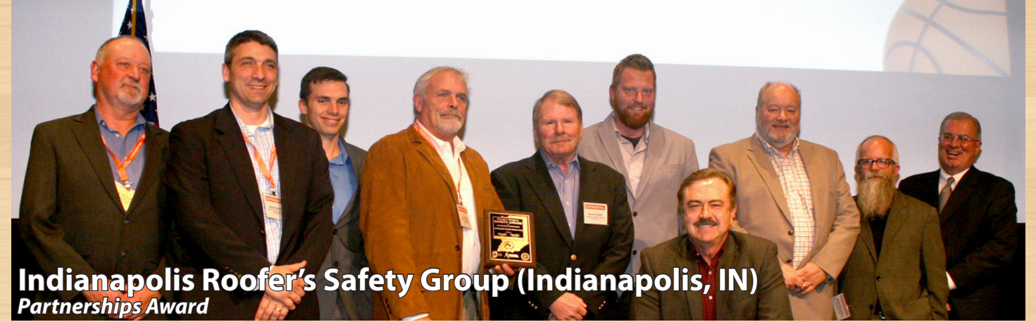
Indianapolis Roofer's Safety Group (Indianapolis, IN) Partnerships Award