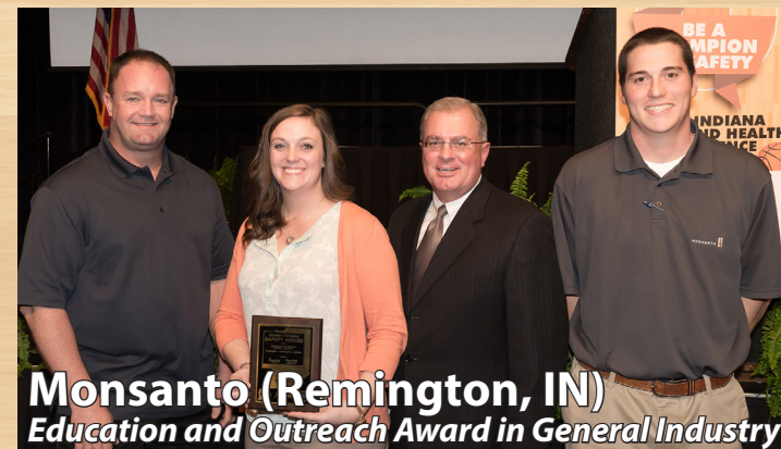
Monsanto (Remington, IN) Education and Outreach Award in General Industry