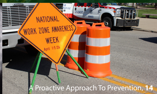
A Proactive Approach To Prevention, 14