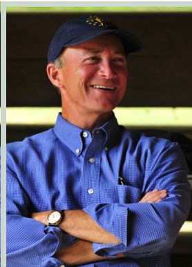
Mitchell E. Daniels, Jr. Governor of Indiana

Indiana's coal mines demonstrated again in 2011 how efficient and productive they were, while continuing to emphasize the protection of workers. More coal was produced with approximately the same number of miners, with no increase in injuries. Indiana will not accept the status quo and we will continue to work for increased efficiency and fewer injuries. The Indiana Mining Board and the Bureau of Mines remain forward thinking as they budget for needed rescue equipment and look for ways to increase safety. Indiana continues to be a leader in coal production and the health and safety of our miners will always be a primary focus.