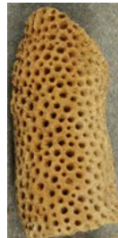
Figure 8. Thamnopora

The first two forms are dominant, typical of high energy conditions, where there is strong wave action and currents. Favosites ( Emmonsia ) grow in mounds (figure 7) and very thick branching forms. The largest [ F. (E.) ramosa ] form colonies over 50 feet (15 m) across with other corals filling in the space between branches as the colony was buried. Alveolites and Thamnopora grow in bushes with branches from 1/4” to one inch thick (figure 8). The latter occurs in colonies as large as 8 feet (2.4 m) across. Platyaxum is an uncommon coral, growing in a plate-like form.