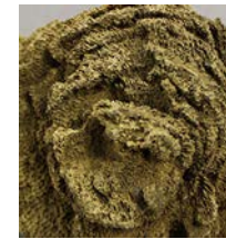
Figure 11. Underside of Alveolites coral

There are 212 species of corals known from the fossil beds at the Falls of the Ohio. Not all occur in the coral beds; some may be found in the slightly higher (younger) rock layers. Additional studies may reveal more or fewer species. It takes experience to identify corals with accuracy. The random orientation of many of the solitary rugose corals make identification even more difficult.