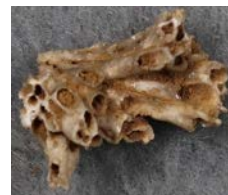
RIGHT: Figure 10. Aulocystis