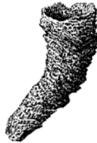
Figure 3. Cystiphyllodes

Cystiphyllodes is characterized by dissepimentaria, bubble-like structures forming layers. Some have a both as internal structures (figure 3).