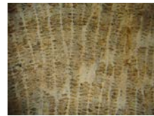
Figure 7. Favosites ( Emmonsia ), detail

Emmonsia was given its own genus name, but some specialists consider it to be a sub-genus of Favosites . These corals vary from a few inches (or centimeters) to 15 feet (4.5 m) across. The larger colonies probably had hundreds of thousands (or millions) of small polyps living at one time.