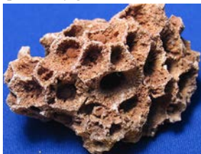
Figure 5. Prismatophyllum

If the rugose coral is massive and the individuals are in full contact with one another, it forms beautiful geometric patterns, like Prismatophyllum prisma (figure 5). The largest colonial rugose coral on the Indiana shore (directly below the Interpretive Center) is a Prismatophyllum colony 11 feet (3.3 m) across. A 30-foot (10 m) colony is reported on the Kentucky side.