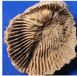
Figure 2. Coral Septa

Horn corals show a wide variation in form, although external form is not a distinguishing feature for identification. Most rugose corals have septa radiating from the center (like bicycle spokes) when observed in cross-section (figure 2).