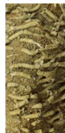
LEFT: Figure 9. Syringopora

Two other corals deserve particular mention because they are unlike other tabulate corals. Syringopora grows in mound or bush-like forms consisting of curved, straight or gently undulating tubes (figure 9). Aulocystis is a dendroid (branching) coral with a tight bush-like form (figure 10).