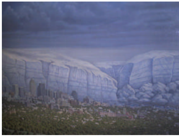
Comparing a glacier to Louisville