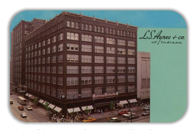
L.S. Ayres & Co., 1 West Washington Street, Indianapolis

Many Hoosiers remember L.S. Ayres as a quintessential example of what they might call Indiana's "Good Ole' Days." During these times local businesses would hire cheery girls to help you shop and serve you chicken velvet soup at the end of your visit. Ayres is one of the most fondly remembered department stores in Indiana, which makes its closing confusing in hindsight. But in the ever-shifting world of retail, the closing of Ayres reveals a broader truth: the future of the department store is bound to the preferences of the middle class.