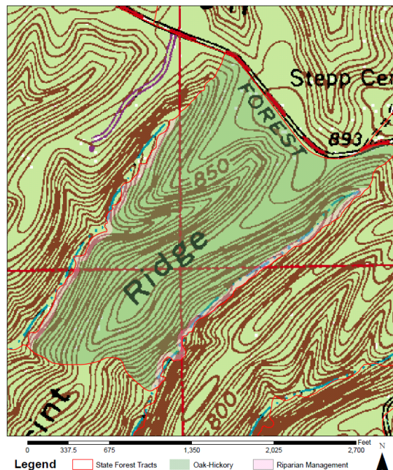
Figure 3. Management Stratum Designations for M1306

As the Oak-Hickory component of the Eastern Hardwood Ecosystem provides the most significant wildlife, timber resource, and value the retention of this stratum is important in the Property's longterm resource management program. The Oak-Hickory timber type covers roughly 92% of the tract or about 73 acres. The overstory of this tract is dominated by Chestnut Oak, Black Oak, Scarlet Oak, Yellow Poplar, White Oak and Pignut Hickory. To a lesser extent Shagbark Hickory, Northern Red Oak, Sugar Maple, and Sassafras were also present. The