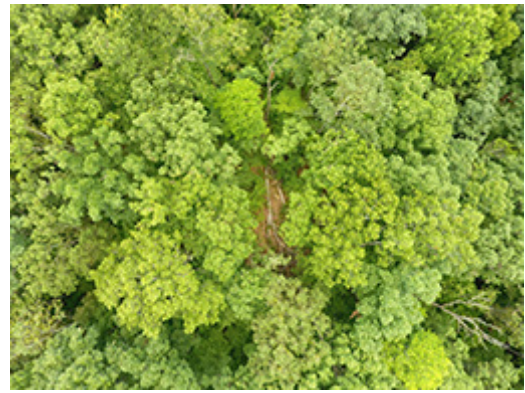
Division of Forestry

TRUTH: Backcountry areas were established in 1981 to provide a primitive experience for hikers and campers. Upon designation of these areas, a policy was developed stating that “hunting will continue to be allowed in the backcountry area, as well as timber management”, and that timber harvests would be restricted to “single-tree selection of mature, damaged or diseased trees.” Backcountry areas were designated on three state forests—Morgan-Monroe, Yellowwood, and Clark. Management activities on all backcountry areas have been designed to maintain the primitive recreational experience. Timber harvests are scheduled on a longer reentry period than on other state forests—rather than the normal 15-20 years used for other tracts, these backcountry areas are scheduled at 30- to 40-year intervals. Since 1981, timber harvests have been part of the management on all backcountry areas. The area within Morgan-Monroe/Yellowwood had several harvests in the 1960s. Recently a harvest was conducted on 299 acres to remove dead and dying ash, tulip poplar and chestnut oak. A total of 1,733 trees were harvested.