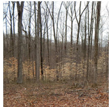
D. Rogler/IN DNR

TRUTH: Single-tree selection harvests are preferred for the management of a relatively mature, diverse forest that promotes the regeneration of shade-tolerant trees such as sugar maple and American beech. The small canopy gaps created by single-tree selection quickly fill with the expanse of the crowns of surrounding trees. Not enough light gets to the forest floor, so these gaps are filled by the shade-tolerant trees present in the understory. Tree species that are shade intolerant (tulip poplar, pecan, black walnut) or have intermediate tolerance (white oak, Northern red oak, hickory, yellowwood) will not regenerate using single-tree selection harvest. To regenerate these species requires larger openings in the canopy to allow sunlight to reach the forest floor for the majority of the day. As such, forest management should include timber harvesting practices that incorporate shelterwood harvests and the creation of larger openings to regenerate tree species with lesser shade tolerance.