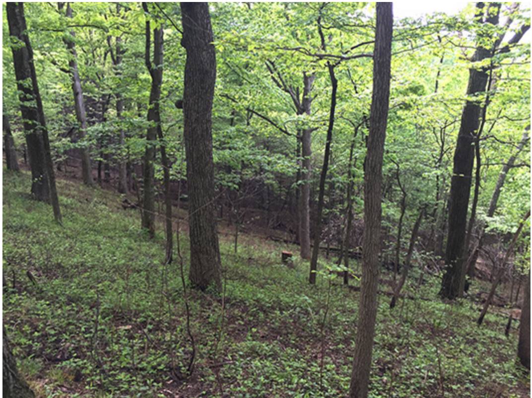
Ten O'clock Line NP2