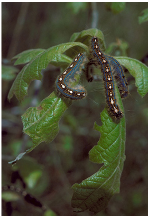
The emergence of forest tent caterpillars in the spring coincides with newly hatched forest birds. These caterpillars are found in forests with a dominance of oak trees. Sixty bird species have been documented to eat these caterpillars, including White-breasted Nuthatch, Yellow- and Black-billed Cuckoo, Carolina Chickadee, Baltimore Oriole, and numerous wood warblers, all found in Indiana's state forests.