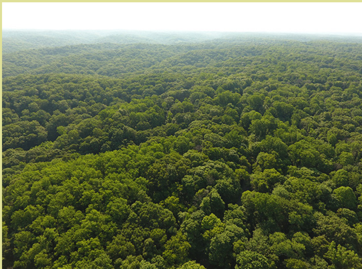
Morgan-Monroe State Forest