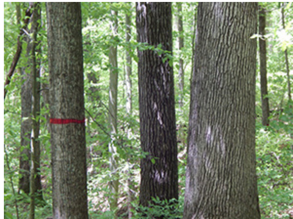
D. Rogler/IN DNR

On the state forests, the maximization of income is never the goal for conducting a timber harvest. Every tract in every state forest has a management goal and objectives to meet that goal written in a management plan. In most cases the goal of the tract is to improve the forest for the future. Most often, dead or dying trees are selected to encourage the growth of the remaining trees and to improve the health of the forest overall. The biggest and the best trees are most often left in the tract. So, the trees that are sold are usually of lower quality or are species that do not contribute as much to wildlife, which in turn brings a lower price. But not all dead or dying trees are selected for harvest. A certain number of “snags” are left per acre for wildlife. Another consideration in the price that is paid to the Division of Forestry.