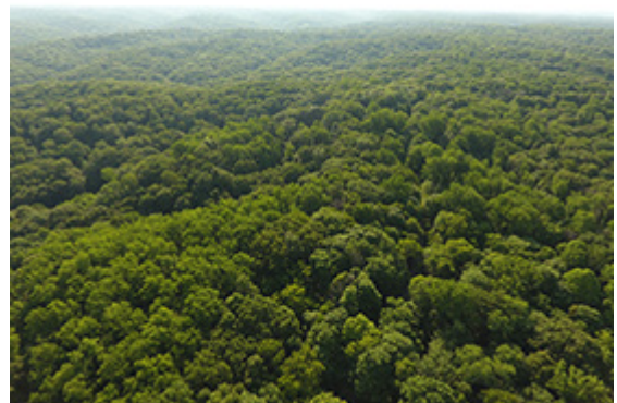
Division of Forestry

Oak-hickory forests have been part of the Indiana landscape for thousands of years. Oaks became the predominant species about 7,000 years ago, concurrent with the warming of the climate, the presence of fire, and the arrival of humans. Humans have been the driving disturbance factor in Indiana forests ever since. Fire was used to clear land for agricultural use and to drive or create conditions for improved habitat for wildlife like bison and deer. Even today, nature preserves within the state forests receive management to provide for the conditions and habitat needs of many plant and animal species.