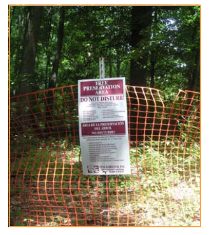
Tree Protection Zone

Install bright orange PRZ fencing around the tree or tree groups. Post signs such as Tree Protec tion Zone—off limits on each side of the fencing.