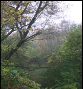
Woodlot trees live in a community and protect each other from the elements.

△ Severing and disturbing the roots hinders trees ability to absorb the water and nutrients that are essential for growth. The tree, in its quest for survival, ends up using the carbohydrates it has stored in the roots which further weakens the tree.