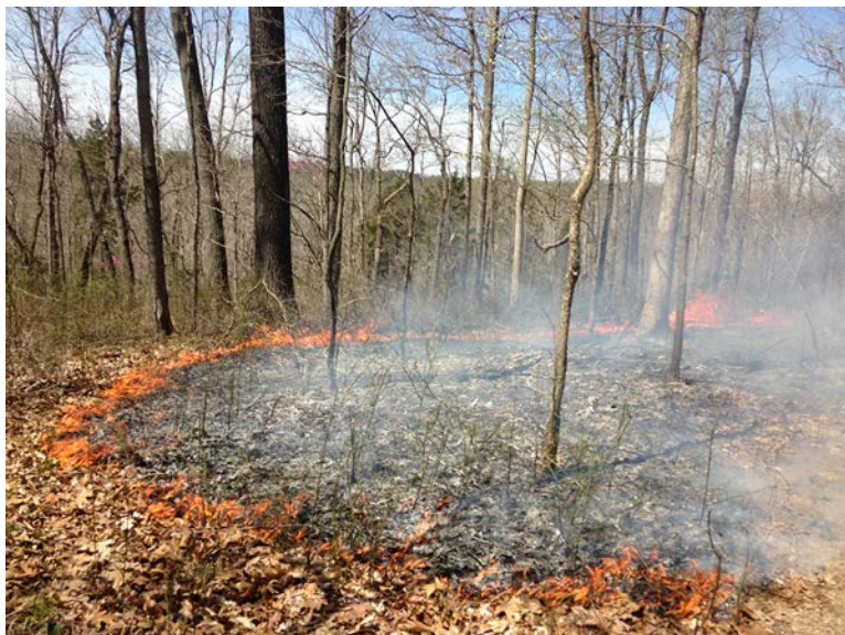
After the initial harvest, prescribed fire is applied to the stand. This low-intensity surface fire mimics the natural disturbance regime that historically favored the regeneration of oak species.

To increase the chances of regeneration of oaks across the state forests, Indiana is applying oak shelterwood harvests in select areas. Regeneration of oak is a primary strategy of the 2020 Indiana Forest Action Plan.