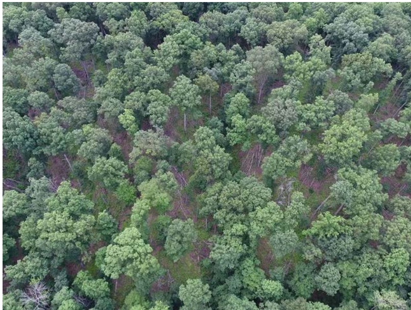
Aerial view of a shelterwood harvest showing the canopies of the large residual trees and the gaps created to allow sunlight to reach the forest floor.

With little or no management, the maple-beech component will increase in state forests. The same is true of harvesting by single-tree selection harvesting, because that method's effects also favor the regeneration of maple and beech.