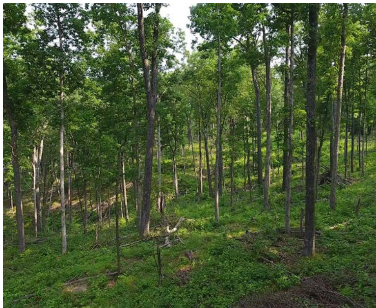
Mature oak stand after a shelterwood harvest mid-story removal. The remaining high-quality trees are widely spaced, providing room for sunlight to reach the forest floor.