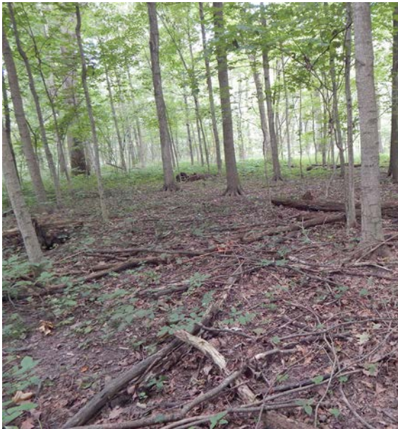
Lack of understory vegetation is typical of forests dominated by sugar maple due to the density of the canopy.