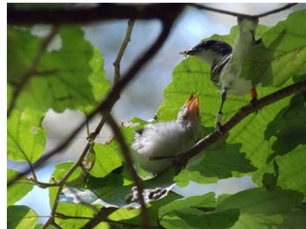
Oak shelterwood harvests can potentially provide preferred habitat for the Cerulean Warbler during the initial cuts while allowing oak regeneration for future nest trees and foraging habitat. In addition to using large white oaks for nesting, insects are more abundant on oaks in comparison to other tree species and are the principal food consumed by adults and fed to young.