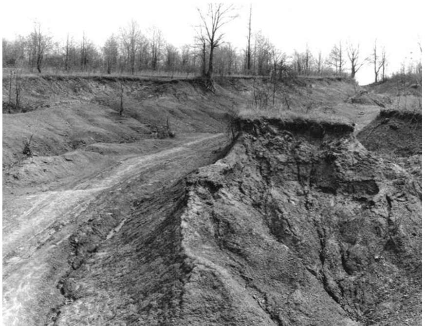
The eroded condition of land acquired for Morgan-Monroe State Forest, circa 1938.

Most of Indiana's oak forests are gradually being replaced by shade-tolerant trees like American beech and sugar maple. This understory is dominated by beech.