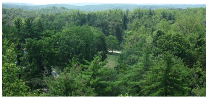
A photo from the same perspective taken in 2012