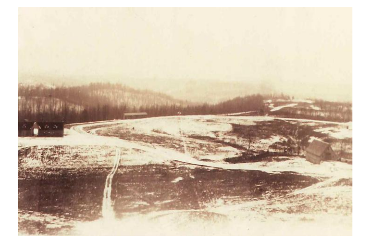
1930 photo of the entrance road at Harrison-Crawford State Forest

State Forests are being managed by professional foresters and resource specialists to demonstrate a working forest concept. A working forest is actively managed under a stewardship plan that guides its activities to accomplish the desired goals. The working forest can provide a variety of goods and services such as watershed protection, recreation, wildlife habitat, scenic beauty and wood products.