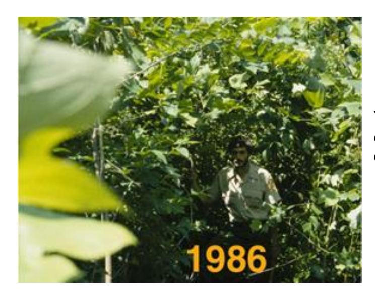
Year 4: 1986 – Trees are starting to create their own shade and suppress other vegetation.