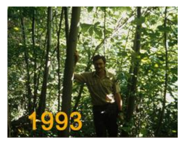
Years 5 through 14: 1987 through 1996 – The trees continue to grow rapidly, with additional shading of the understory. Self-pruning of side limbs begins as shade deepens. The opening is beginning to take on the appearance of a forest again.