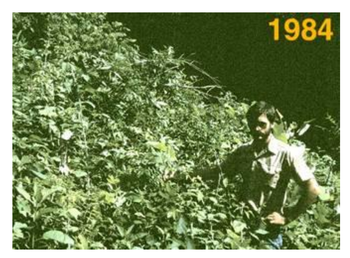
Year 2: 1984 - The trees were starting to assert themselves, with tuliptree the main species by number as would be expected on a good site that had been opened to full sunlight. There was little, if any, oak in the over story.