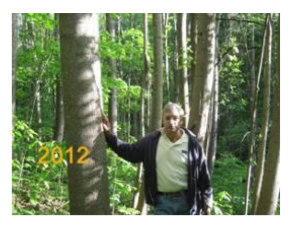
Years 25 through 31: 2007 through 2013 – Tuliptrees in the photos are between 12 and 14 inches in diameter by 2010. The tract was harvested again in 2008, taking a total volume of 210,888 bd. ft.