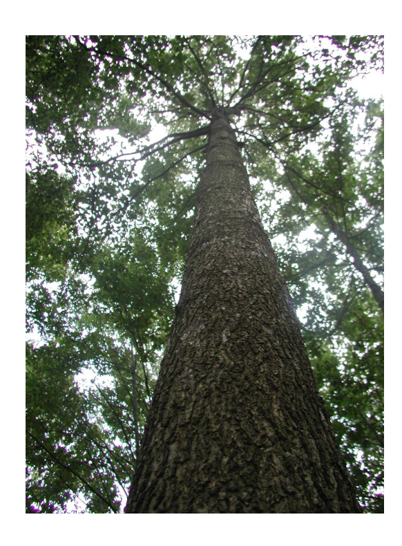
A "plus tree" selected for growth and form

Researchers from Purdue University and the Division of Forestry's Tree Improvement Program have been collecting seed and scion wood (branch cuttings for grafting) from "plus trees" for more than 35 years.