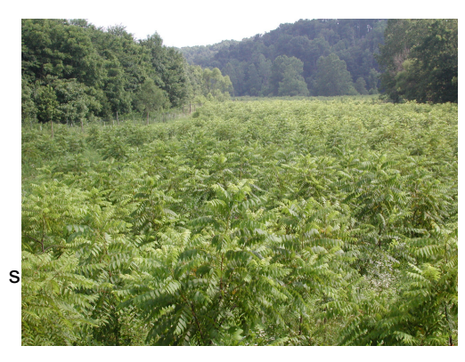
A 4 year old black walnut progeny test

Progeny testing (comparative study plantings of the offspring) is underway to quantify the increased potential of the orchard trees to pass on their good traits to their seedlings.