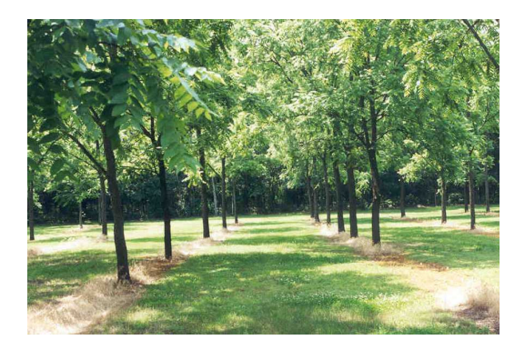
A grafted black walnut seed orchard

population of "plus trees" and also with common nursery-run planting stock. Trees that exhibit the best performance are retained for seed production. Those that don't perform well are eliminated from the planting.