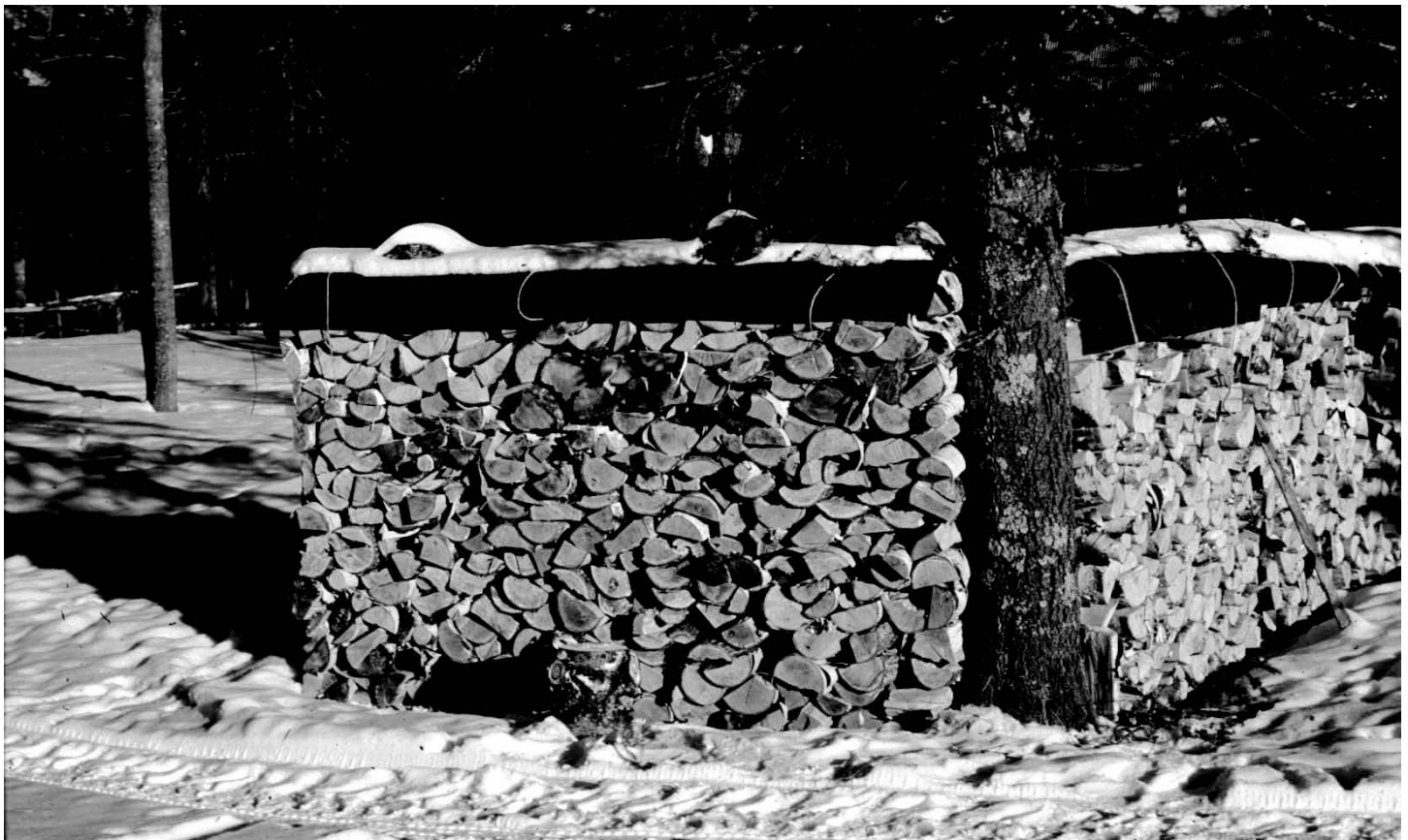
Stack firewood in a sunny, well-drained location 30 feet or more from your house. Cover your pile to keep out rain and snow.

Some tree species are naturally resistant to decay and insect attack, and can provide long-lasting fence posts. The natural resistance varies from tree to tree and is particularly dependent on the age of the tree. Younger trees have less heartwood and are less resistant.