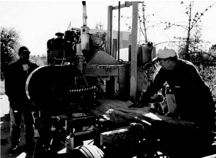
A portable mill can convert your backyard woods sawlogs into lumber for do-it-yourself projects.

Sawlogs converted to green (fresh-from-the-saw) lumber can be adequately air dried outdoors for rough construction uses such as sheds, barns, fences, and crates. Successful air-drying is dependent upon warm air temperature, low relative humidity, and good circulation of the air within the pile. The temperature and relative humidity vary with