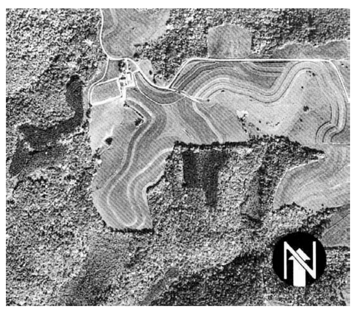
An aerial photograph helps you identify land uses and variations in your backyard woods.

As you walk through your property sketch tree-covered areas, treeless areas, unique features like rock outcrops, streams, ponds, swamps, wet spots, stone fences, and colorful foliage, roads, trails, house, other structures, and yard. Be sure to walk your boundary lines, and if they are not evident, locate them and mark them.