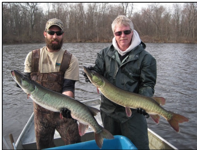
Two 35+” Muskies collected from a 2013 survey.