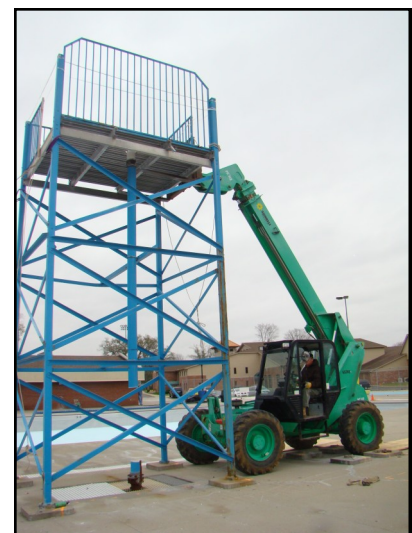
The Franklin City Parks Memorial Pool slide being taken down for use at Camp Atterbury.