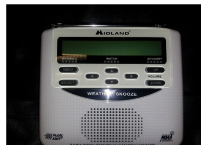
The 2012 NOAA radios distributed throughout the state of Indiana.

Most all-hazard radios require a Specific Area Message Encoding (SAME) code number in order to limit the receipt of emergency messages to a specific geographic area. The list of Indiana counties and their corresponding same codes are available at http://www.weather.gov/nwr/CntyCov/nwrIN.htm •