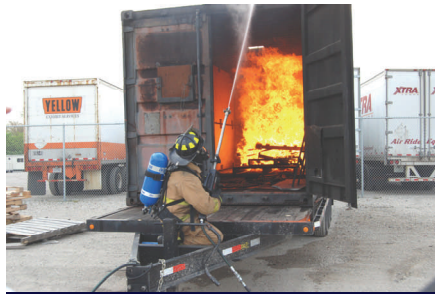
A firefighter demonstrates an ultra high pressure cooling/firefighting system as part of a hands-on-training opportunity.

Nearly 7,000 Hoosier fire service personnel attended this year's Fire Department Instructors Conference (FDIC). Held April 19-24, 2010 in Indianapolis, the conference hosted 27,481 attendees and offered more than 24 hands-on training opportunities, 34 preconference workshops, and more than 160 classroom presentations for all levels of fire