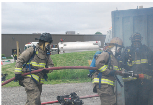
Citizen firefighters put out a controlled fire as part of the Hendricks County Fire Ops 101 course where citizens and officials simulated the job of a firefighter.