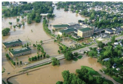
Columbus Regional Hospital after June 2008 flooding. FEMA gave $100 million for repairs to Columbus Regional Hospital. The hospital paid a 25 percent match for recovery repairs.

All emergency support functions were engaged in the state emergency operations center (EOC) with 24-hour operations running for more than two weeks. IDHS also deployed