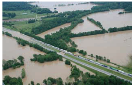
Part of I-70 in Putnam County submerged in flood waters stalls traffic.

allocated to acquire 199 homes in Franklin (Johnson Co.), Morgan Co., Martinsville (Morgan), and Columbus (Bartholomew). Another $5.5 million has been approved to acquire 126 homes in Johnson, Brown and Bartholomew counties, but funds have not yet been allocated as of publication of the June issue of the Hoosier Responder. A bill to provide for summer jobs and disaster relief awaits action in the U.S. Senate before funds can be distributed to the counties. An additional $5 million to acquire 87 homes is under review by FEMA for Morgan, Brown, Marion, Owen, Dekalb, Shelby and Tippecanoe counties. Community and homeowner participation in any HMGP buyout is voluntary. Acquired properties will be converted to open space in perpetuity. ■