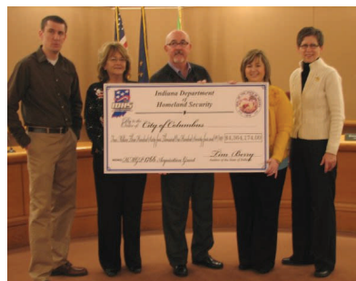
IDHS presents the City of Columbus officials with a public assistance check to recover from June 2008 floods.

response personnel to the hardest hit areas.