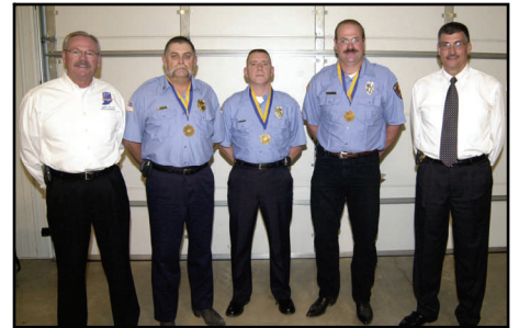
the three men.

Approximately 85 firefighters, most from Lyons and Switz City, and their family members filled the fire station to honor