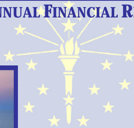
Lake Michigan As seen from Indiana Dunes State Park