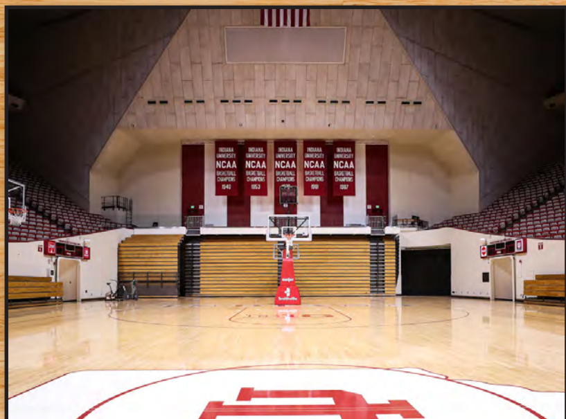
Simon Skjodt Assembly Hall Bloomington