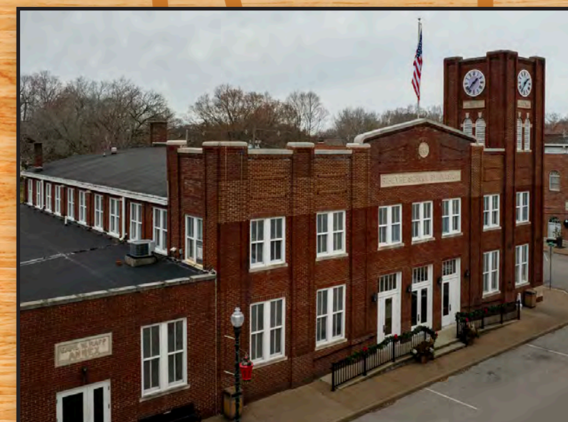
Ribeyre Gymnasium New Harmony