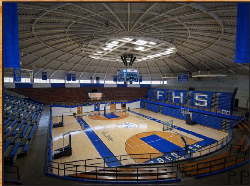
Case Arena Frankfort