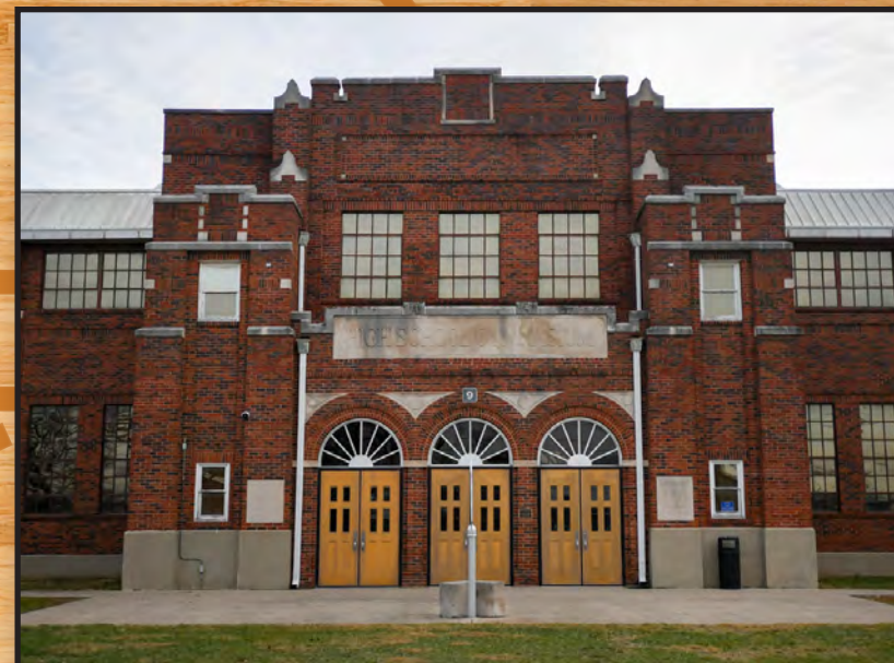
Glenn M. Curtis Memorial Gymnasium Martinsville