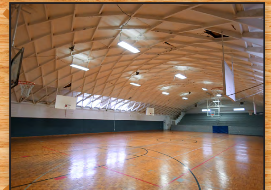
Josiah White's Manual Labor Institute Wabash