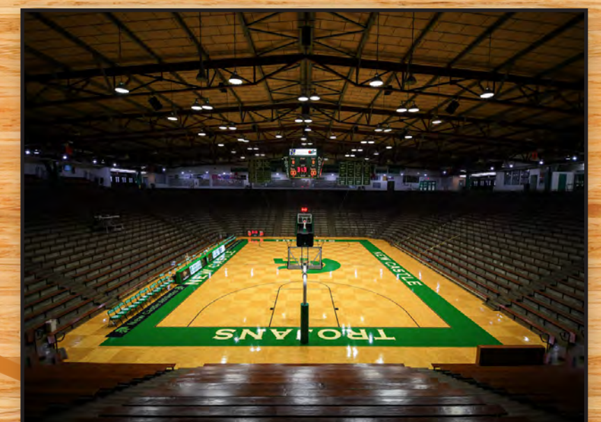
New Castle Fieldhouse New Castle

Indiana's fascination with basketball goes back almost to its invention in 1892. In 1903, the Indiana High School Athletic Association (IHSAA) formed to regulate and administer athletic competitions. Between 1911 and 1937, the IHSAA boys' basketball tournament grew from 12 teams to more than 800, showing the rise in popularity of the sport, or "Hoosier Hysteria." As a result, large gyms were needed for crowds and tournament games. These facilities were built in both urban and rural school districts, leading to the belief that even the smallest of high schools could win with home court advantage.