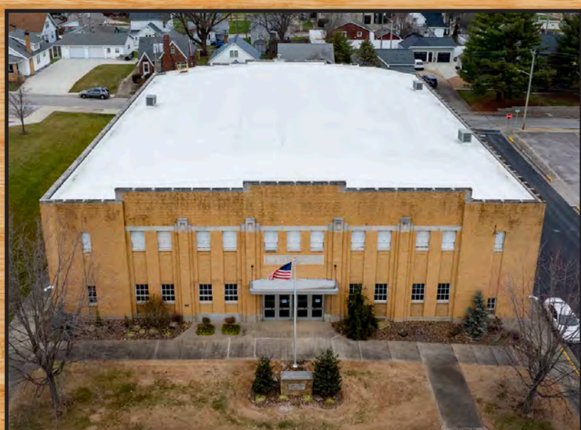
Jasper High School Gymnasium Jasper