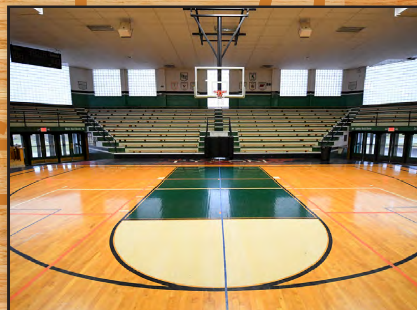
Tyson Auditorium Versailles