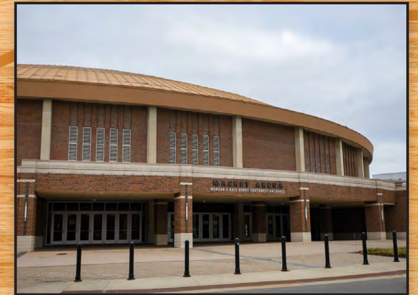
Mackey Arena West Lafayette