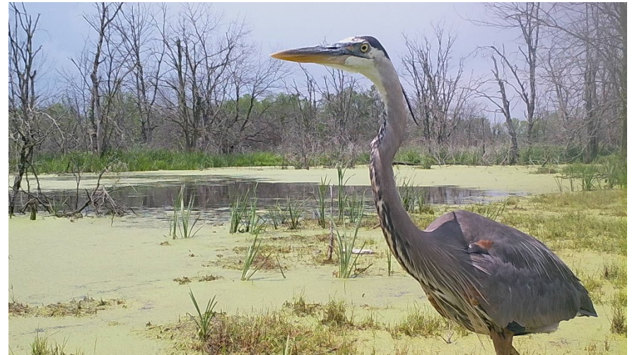
Wetland Reserve Easements