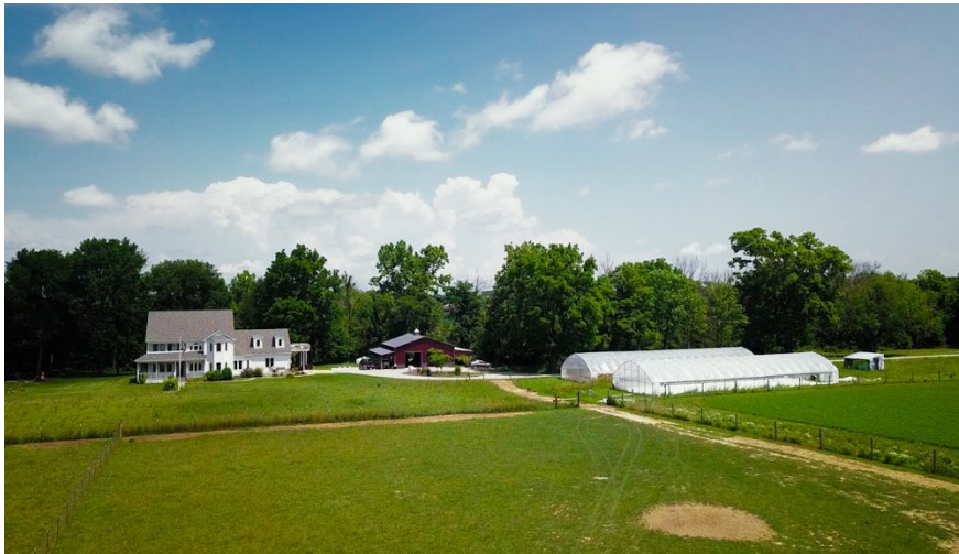
Agricultural Land Easements

ACEP provides financial and technical assistance to help conserve agricultural lands (ALE) and wetlands (WRE) and their related benefits. NRCS offers easement programs to landowners who want to maintain or enhance their land in a way beneficial to agriculture and/or the environment.