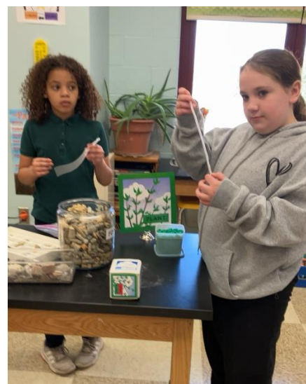
Photos on this page are courtesy of Eleanor Skillen Elementary School.