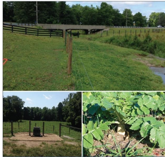
Figure 2. Multiple BMPs were implemented to improve water quality in the watershed, including fencing to keep livestock out of streams (top), a watering facility installed on a concrete heavy use protection area pad (bottom left), and cover crops (bottom right).

Multiple partners collaborated to restore the biotic communities in the Big Creek watershed. IDEM provided four rounds of funding totaling $1,589,757 in CWA section 319 grants to Historic Hoosier Hills Resource Conservation & Development (RC&D), who coordinated the cost-share program to implement the Central Muscatatuck watershed management plan. Historic Hoosier Hills RC&D provided $975,990 in landowner and in-kind matching funds to complete the projects that benefited the Big Creek area and the greater Central Muscatatuck watershed (hydrologic unit code [HUC]-10s: 0512020706 and 0512020701). The U.S. Department of Agriculture provided $140,678 and $49,838 in funding for BMPs in the Big Creek area (HUC-12s: 051202070101, 051202070102, and 051202070104) through the Environmental Quality Incentives Program and the Conservation Reserve Program, respectively. The Indiana Department of Agriculture provided $538,535 in Clean Water Indiana funding for projects throughout Ripley, Jennings, and Jefferson counties, and they provided technical assistance for the installation of BMPs.